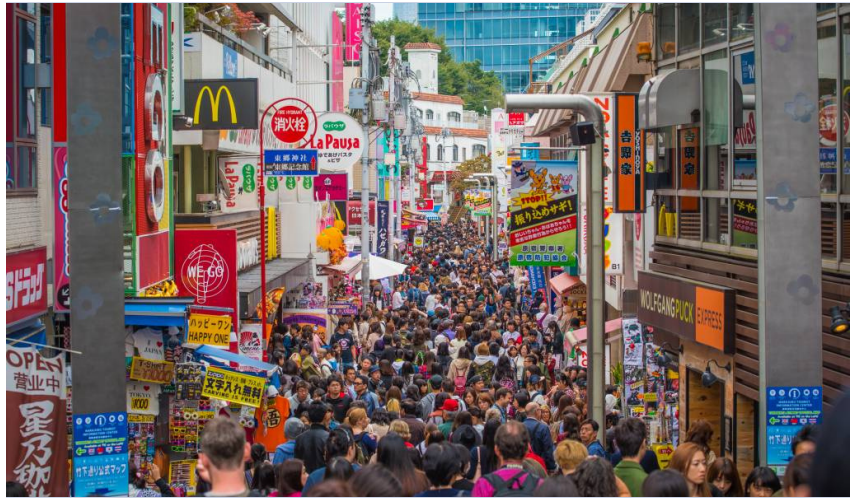
Takeshita Street ( Harajuku )

Harajuku is one of the most extensive gathering points for Tokyo's diverse fashion tribes. Tightly packed shopping bazaar Takeshita-dōri is a beacon for teens all over Japan.