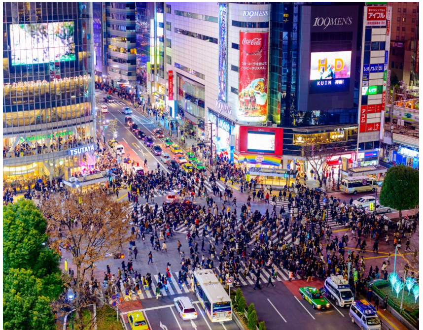
Shibuya Crossing Street ( Hachiko Statue In There )