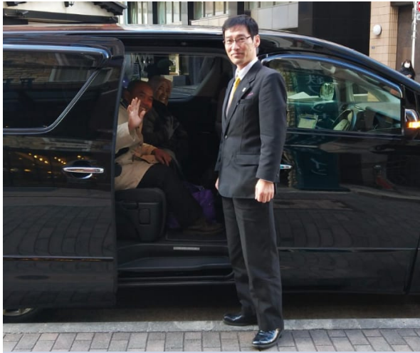
Airport Transfer Private Car

On the first day, our team will pick you up at the airport and assist you with preparations for the tour. A private coach will take you to your hotel in the city's heart.