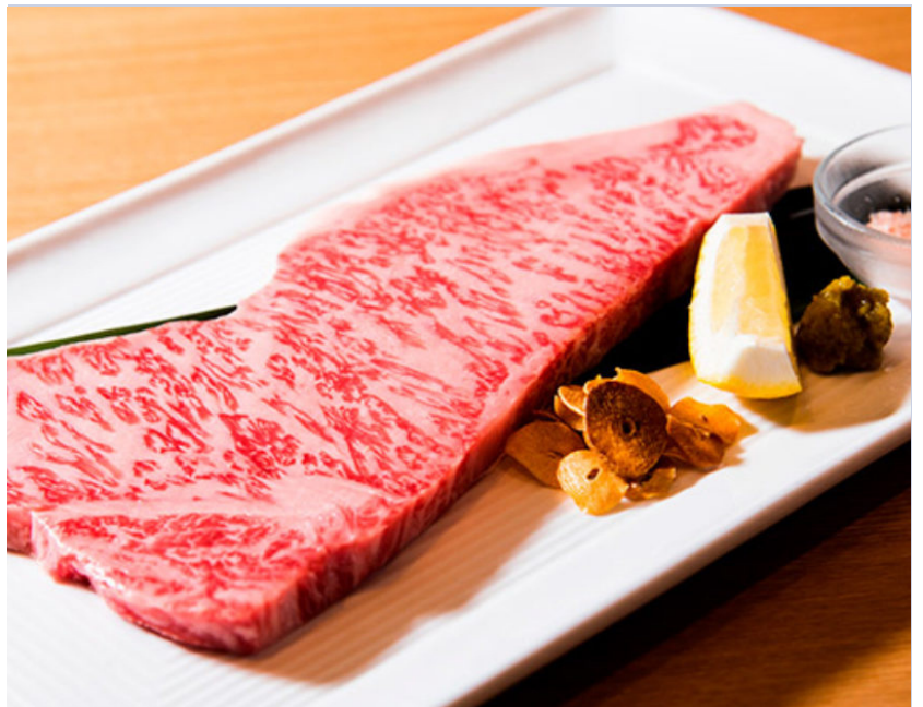
Wagyu Beef Course at One of the best teppanyaki restaurants in Tokyo

Before check-in at the hotel, you can enjoy free wagyu steak lunch at one of the best teppanyaki restaurants in Tokyo.