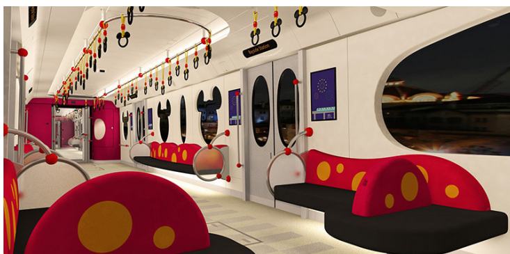
Inside Tokyo Disney Train

After breakfast, your guide will pick you up from the hotel. Today you will go to Tokyo Disney Resort by railway. You can choose between Tokyo Disneyland or Tokyo Disneysea. From Maihama Station to Tokyo Disneyland, it's only five minutes on foot. To get to Tokyo DisneySea, hop aboard the Disney Resort Line and get off at Tokyo DisneySea Station.