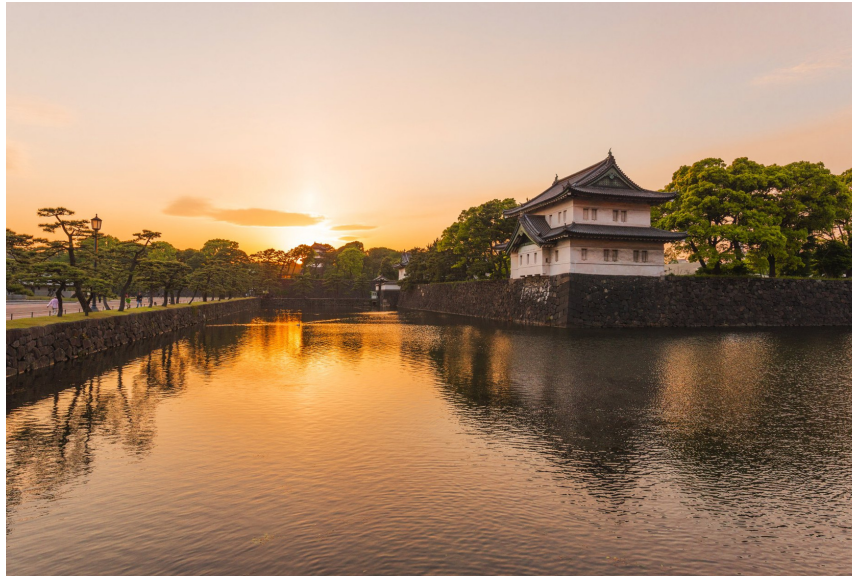
Imperial Palace East Garden

The Imperial Palace East Gardens are a part of the inner palace area and are open to the public. They are the former site of Edo Castle's innermost circles of defense, the honmaru ("main circle") and ninomaru ("secondary circle").