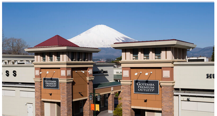
Gotemba Premium Outlet